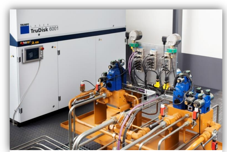
TRUMPF laser source powering the HYBWELDCUT demonstrator

In practical terms , the demonstrator consists of a frame, similar to that of Pres-Lap or Prep-Lap-type welding machines, which is connected to a disk laser source by 3 optical fibres, of