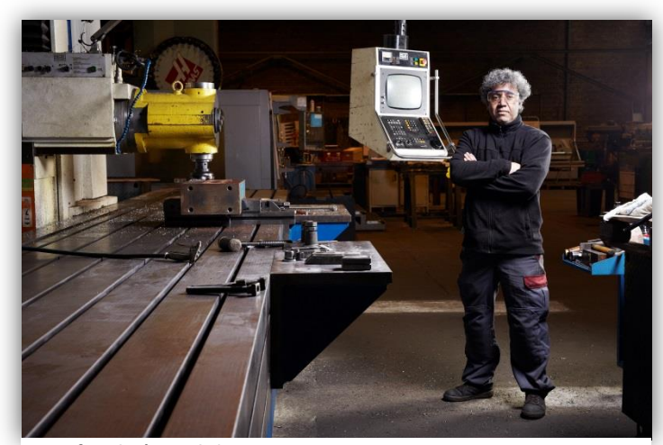
One of Malex's workshops